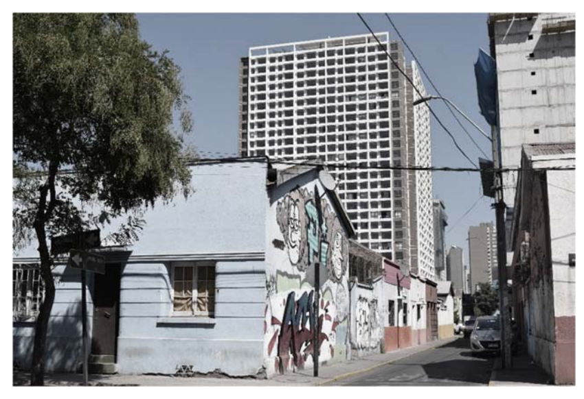
Figure 1: Urban speculation has taken place in the Commune of Estación Central at Santiago de Chile. In consequence, non-listed architectural heritage is nowadays vulnerable to be demolished and replaced by new speculative architecture.

recent decades, no contemporary activities have replaced the original functions of this safeguarded area. Besides, no plans or public financing have been projected to give this interesting abandoned industrial site new uses or purposes.