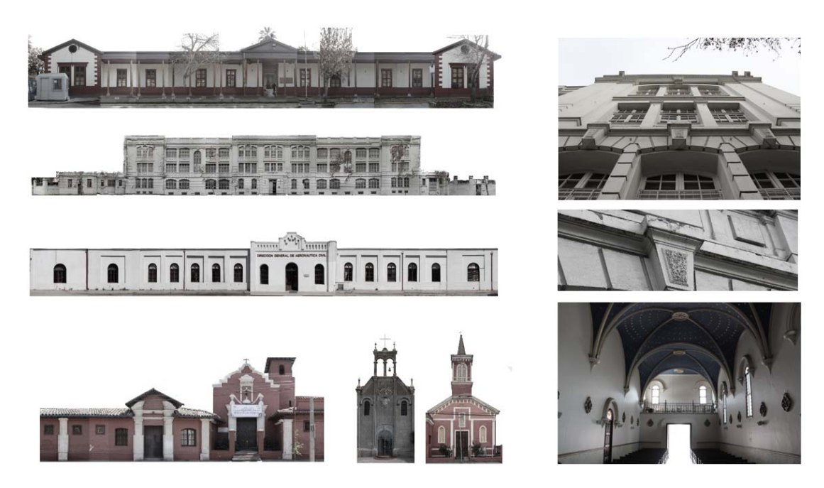
Figures 13 – 21: Some cases of non-safeguarded architectural heritage at Estación Central Commune: Ancient Agriculture Practical School, School República de Venezuela, Aeronautical Technical School, Amengual Convent, Santiago Apóstol Chapel, and Las Carmelitas' Chapel. Nowadays this architecture is in use, but still vulnerable of demolition.

IOP Conf. Series: Materials Science and Engineering 471 (2019) 082036 doi:10.1088/1757-899X/471/8/082036